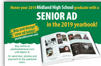
Customized fliers and postcards