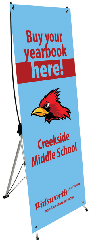
Vertical vinyl banner

To order Customized Marketing, go to walsworthyearbooks.com/marketing and click on Order Customized Marketing .