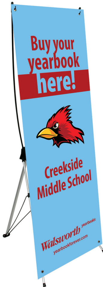
Vertical vinyl banner